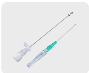
KANNULEX PENVION \alpha Safety IV cannula without wings & port