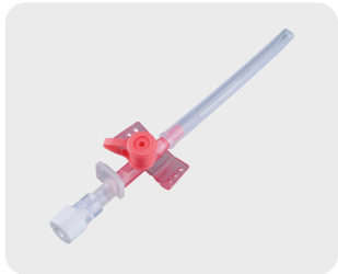
KANNULEX EMPORTA IV cannula with wings & port