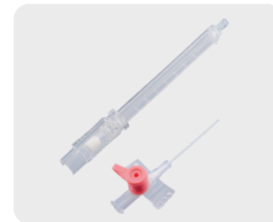
KANNULEX PORTEGO Safety IV cannula with wings & port