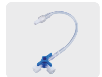
KANNULEX TRIFLOW EXTEND 3-way stopcock with extension