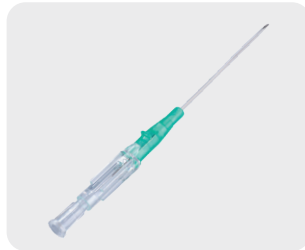
KANNULEX PENVION IV cannula without wings & port