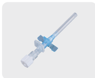
KANNULEX AVION IV cannula with small wings