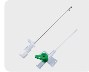
KANNULEX \alpha SECURE Safety IV cannula with wings & port