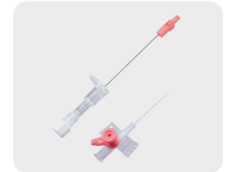
KANNULEX \beta SECURE Safety IV cannula with wings & port

ULTRA-THIN, FLEXIBLE, ELECTROPOLISHED V-POINT NEEDLE