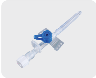
KANNULEX PORTVION IV cannula with wings & port