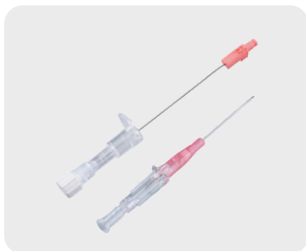
KANNULEX PENVION \beta Safety IV cannula without wings & port